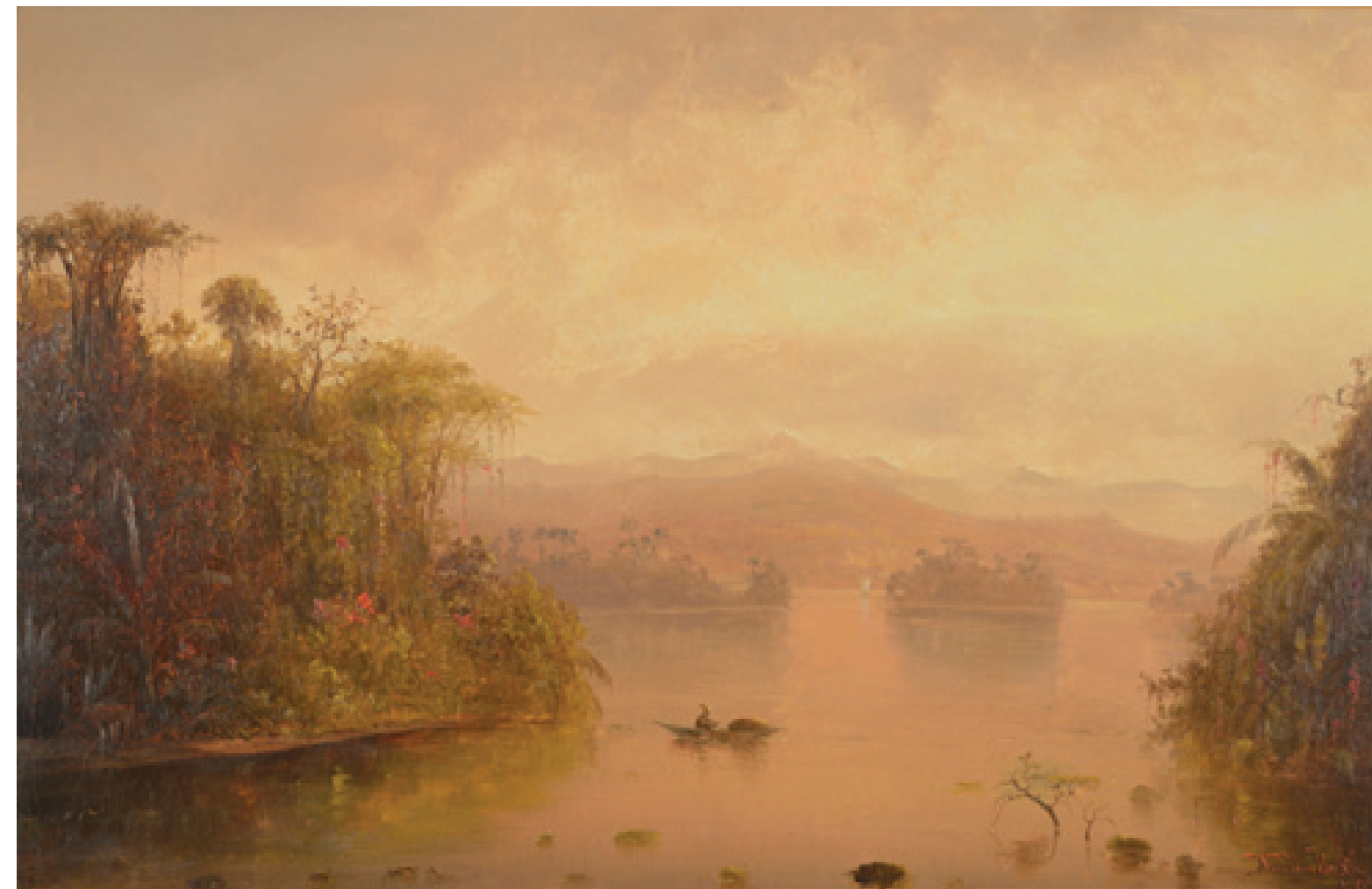
Norton Bush 1834-1894 In the Tropics, South America (1889) Oil on canvas, 22" x 36"