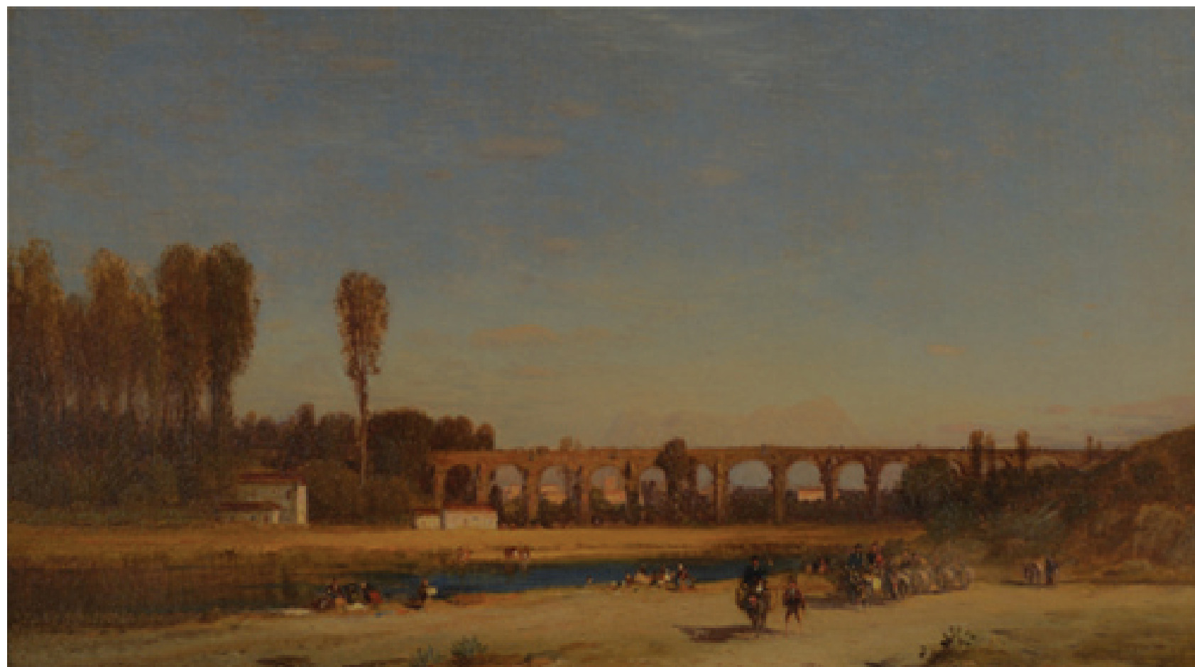
Samuel Colman 1832-1920 Andalusia Spain (c.1861) Oil on canvas, 10" x 18"