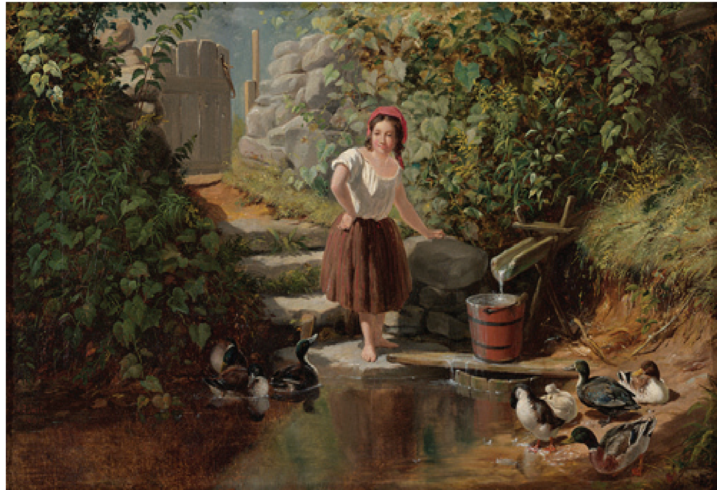
Arthur F. Tait 1819-1905 Pleasant Thoughts (1859) Oil on canvas, 12" x 18"